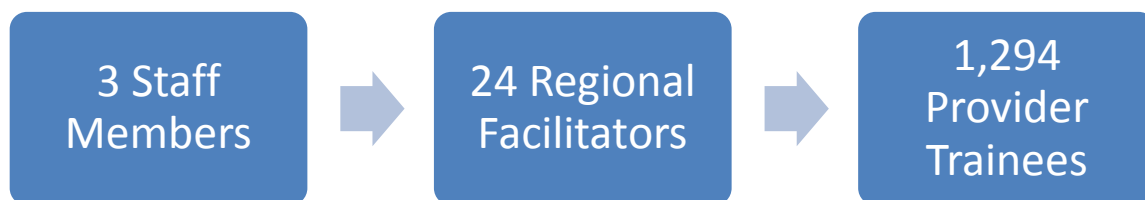
Figure 1. Number of participants involved in the project's training-of-trainers workshops

The sample for the evaluation consists of the 24 TOT facilitators who were trained by three Early Care & Learning Council staff members and 1,294 child care providers 1 who were trained by the facilitators. The 24 facilitators were selected through an application and review process facilitated by the Early Care & Learning Council. Providers voluntarily signed up for the trainings that were offered by the facilitators in their regions.